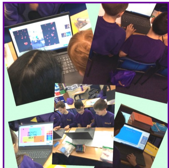
Using movie editing software to create our Beauty and the Beast film.