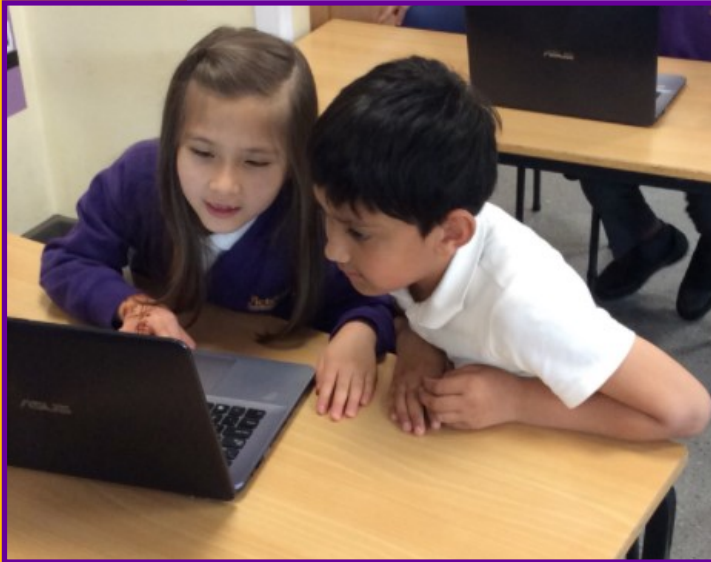
Year 3 have been busy researching bugs.